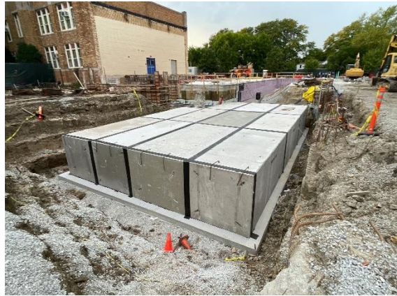
Storm Trap System