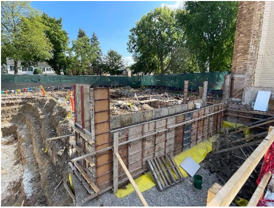
Framing at grade beam #1