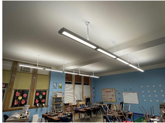
New light fixtures at existing classroom room #101