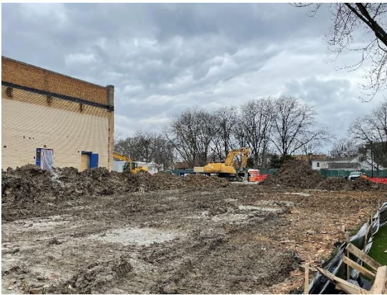
New basement excavation