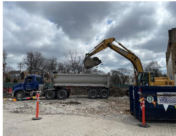
Excavation material haul-off