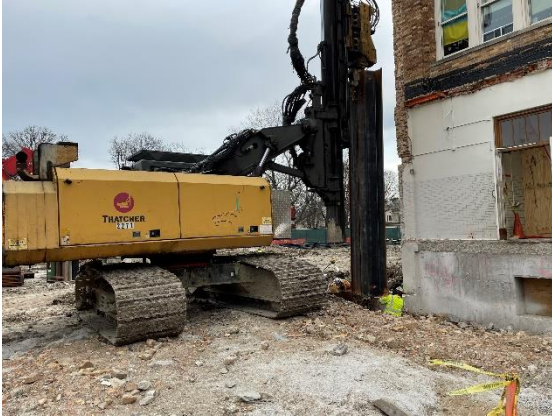
Earth Retention System installation