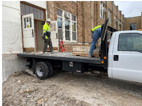
Removal of salvaged glazed block