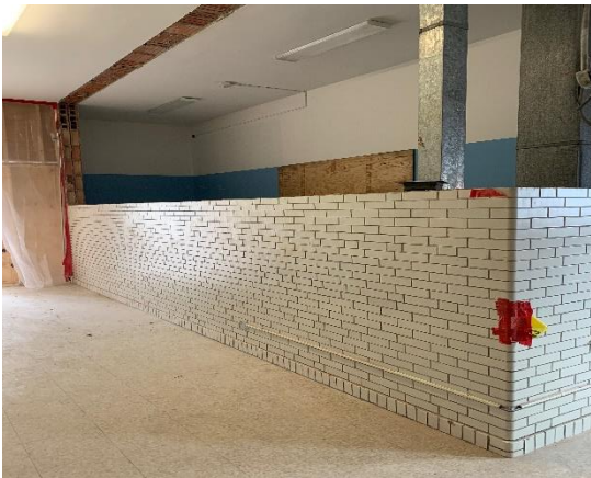
Existing glazed block removal and salvage