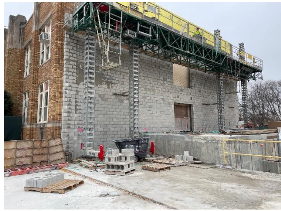
Masonry installation at South wall of new annex