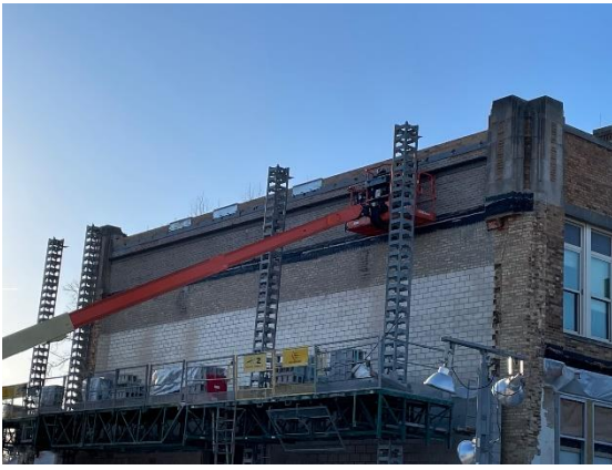
Angle installation at main building (North)