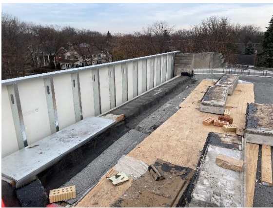
Temporary roofing installation at main building